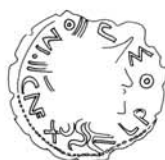
IMAGE ABOVE: ROMAN SILVERED BRONZE DENARIUS WITH IMAGE OF GALLIC WARRIOR, CA. 118 BCE, FOUND IN THE SANCTUARY OF THE ETRUSCAN ARTISANS, CETAMURA DEL CHIANTI (NOT TO SCALE)

HOURS: TUESDAY - SATURDAY 4-7PM, SUNDAYS 10AM-12/4-7PM