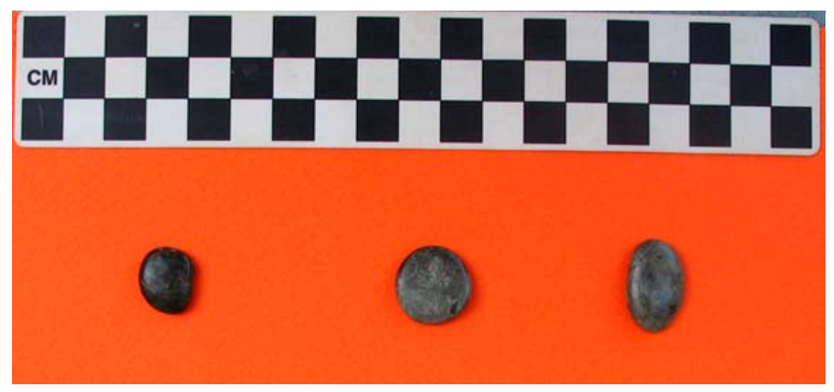
Fig. 3. Gaming pieces from Structure L