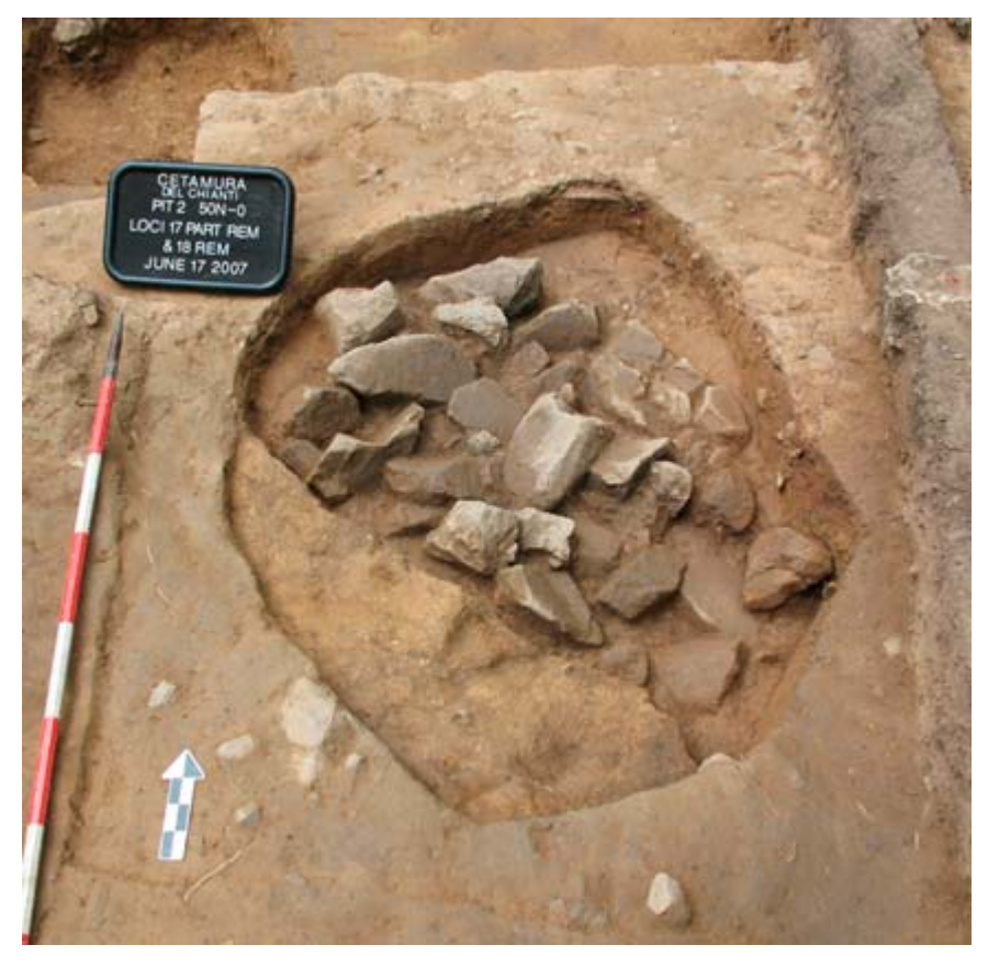
Fig. 13. Pit 2 during excavation