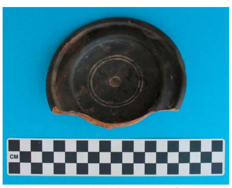
Fig. 12. Pit 1B: Black gloss saucer (cf. Fig. 1)