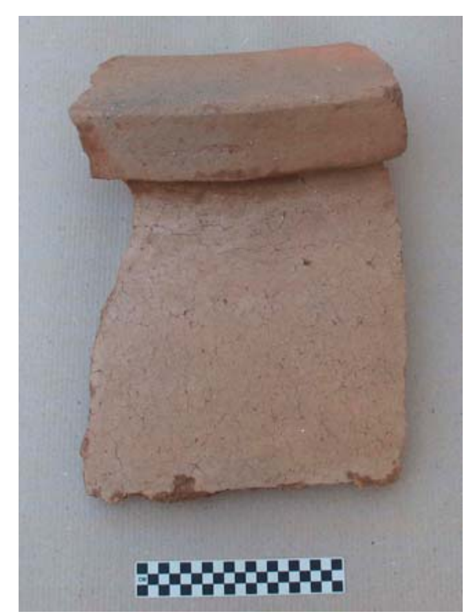
Fig. 16. Dolio