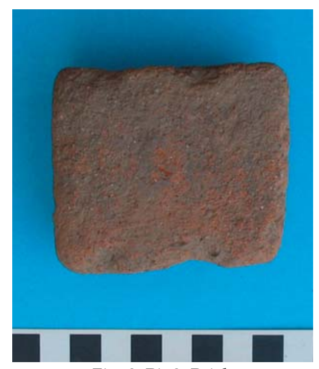
Fig. 8. Pit 2: Brick