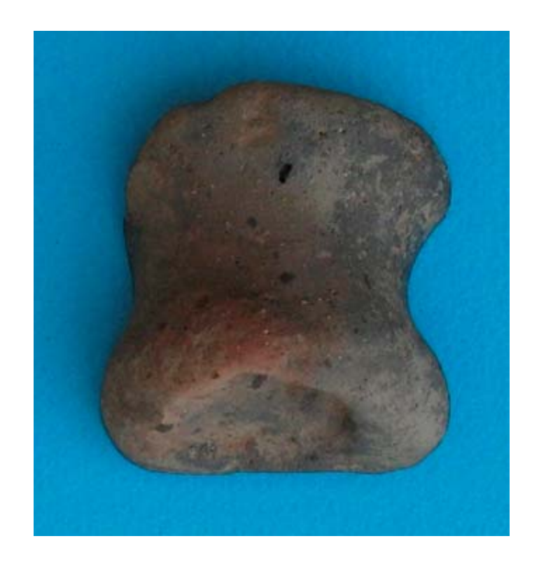
Fig. 7. Pit 2: Spool