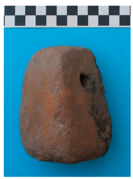
Fig. 6. Pit 2: Loomweight