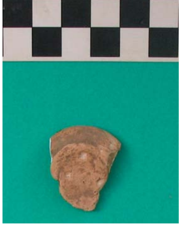
Fig. 10. Pit 4: Miniature cup