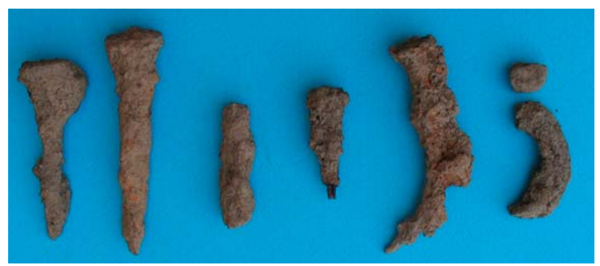
Fig. 2. Pit 2: Nails