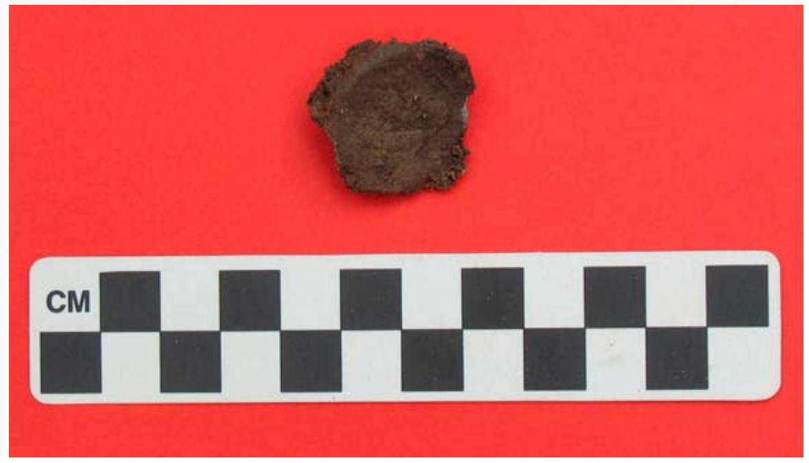
Fig. 14. Pit 2: Roman Republican coin, prow series