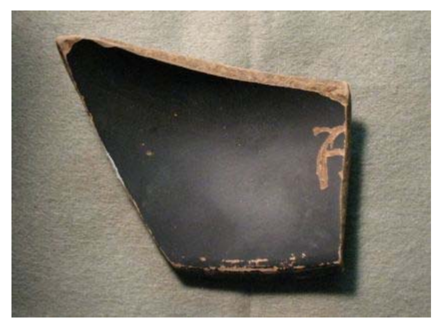
Fig. 5. Black gloss bowl with inscription A,L, P (or L, A, P, or A, P, L)