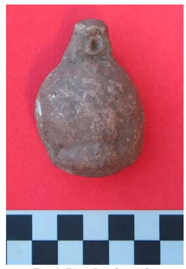
Fig. 9. Pit 4: Lead weight