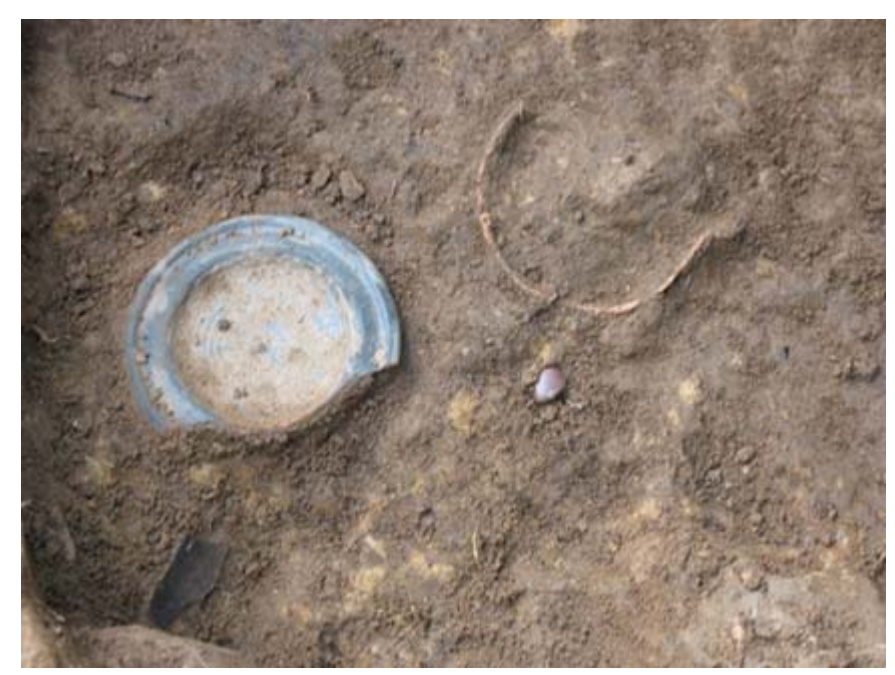
Fig. 1. Pit 1B during excavation: Black gloss saucer and beaker