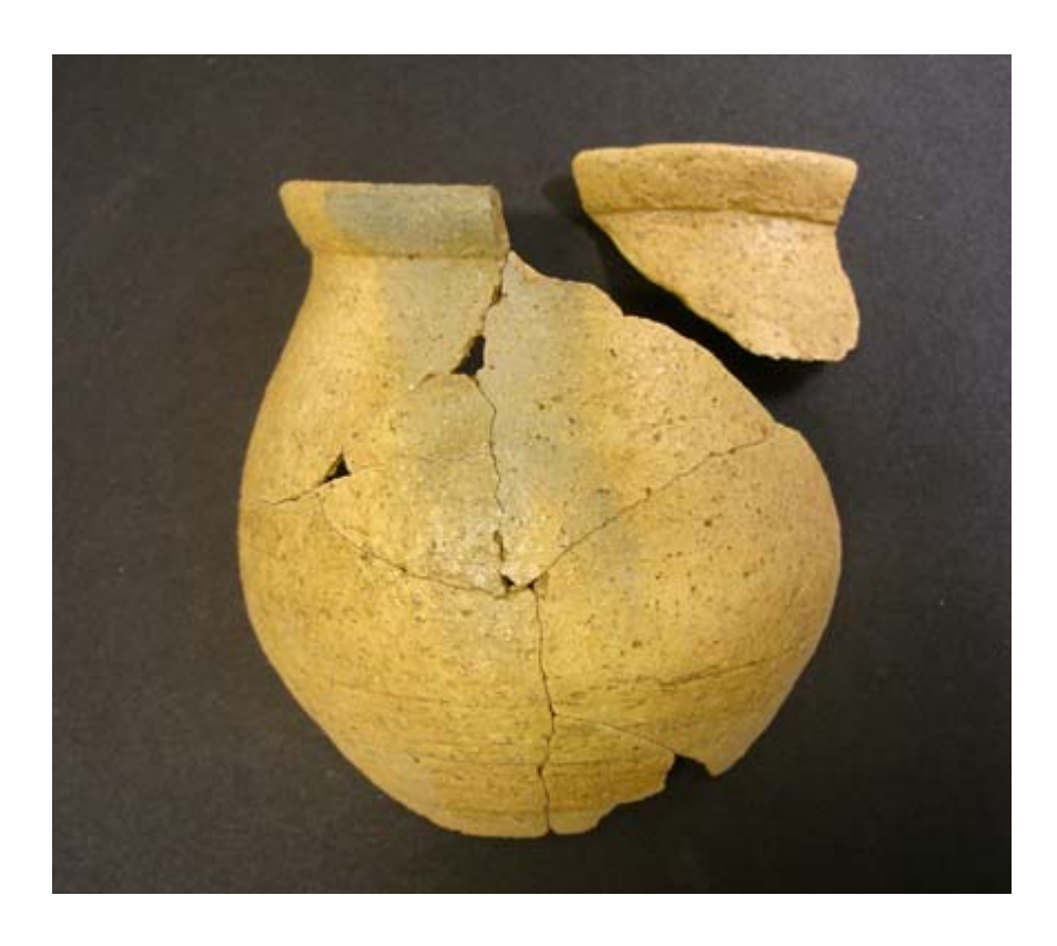
Fig. 11. Pit 1B: beaker