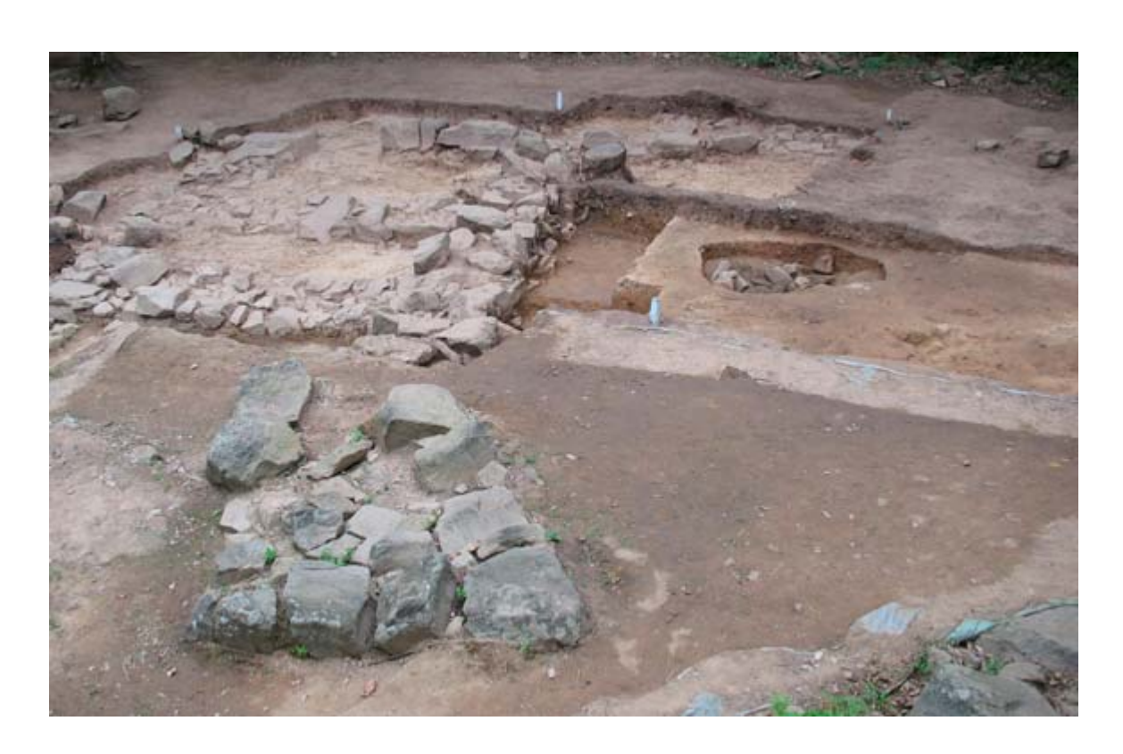
Fig. 15. View of rooms in Structure L